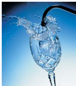
Clean safe water & Ice